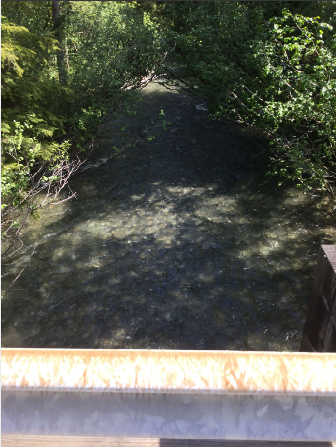
Figure 2.—Channel from bridge at waypoint 441.