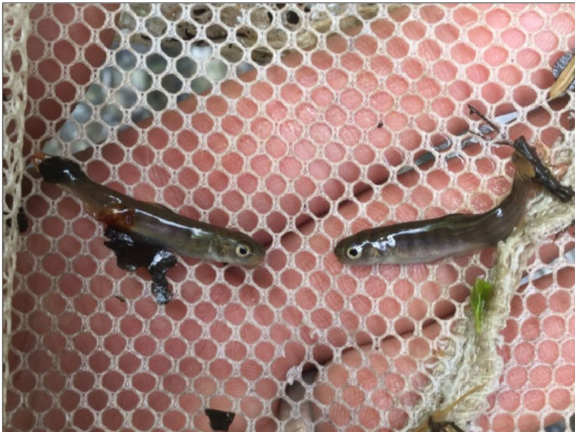
Figure 1.—Juvenile coho salmon captured at waypoint 441.